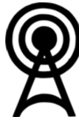
General Radio Operator License