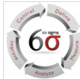
Six Sigma Green Belt